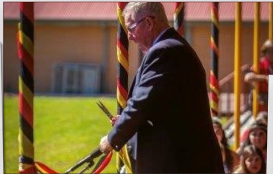
Open for business