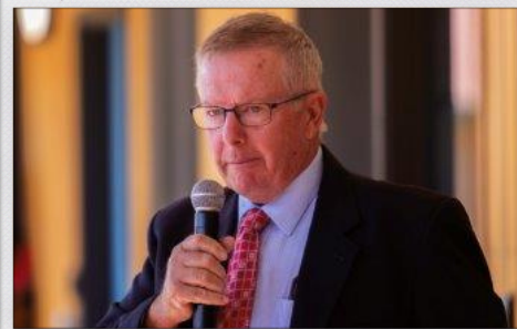
Mark Coulton MP (Minister for Regional Health, Regional Communications and Local Government)