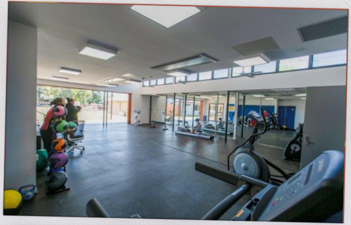
Exercise Therapy room