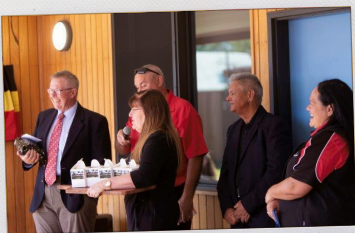
Thank you to Mark Coulton